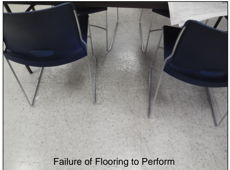
Failure of Flooring to Perform